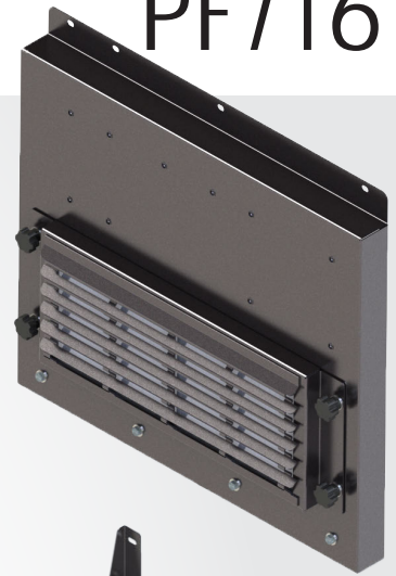
Return-air backing plate

NOTE: Extra bolt holes are provided for mounting other equipment, such as radios. If not needed, fill with provided bolts.