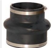
7H6 Hump Hose