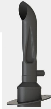
AD0091 EXHAUST SCAVENGER