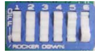
Table 2: Setting the Pressure Units